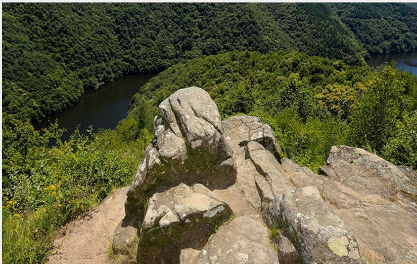
Roc du Busatier (Office de tourisme VEM)