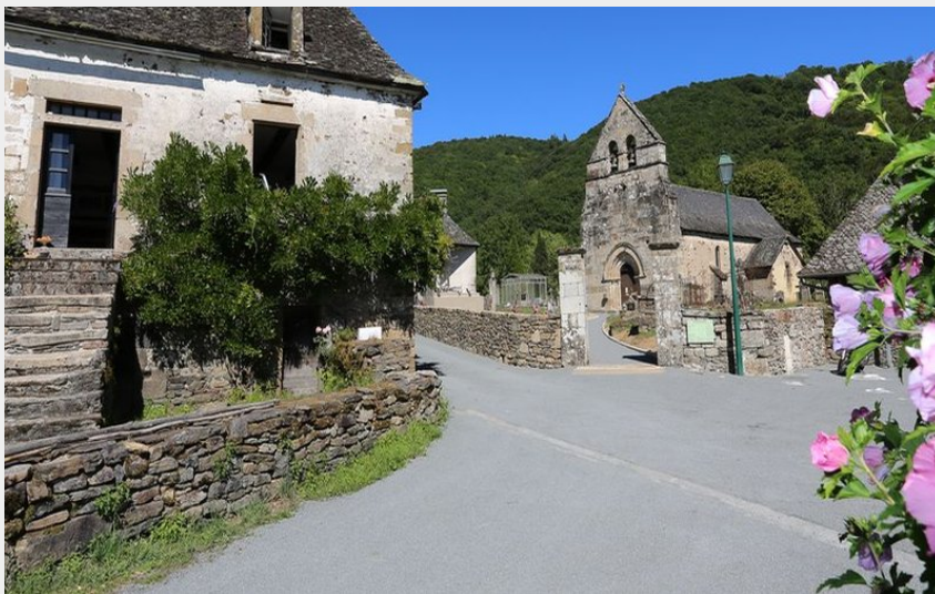
Le Vieux Bourg (D.Agnoux - CC VEM)