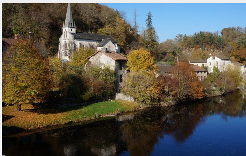
Quartier du Pont et église Saint-Martial