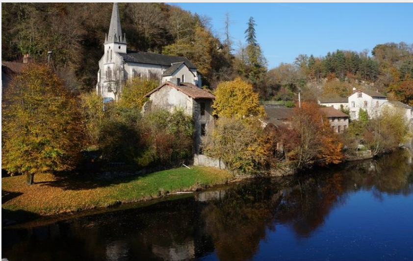
Quartier du Pont et église Saint-Martial (Office de tourisme de Noblat)