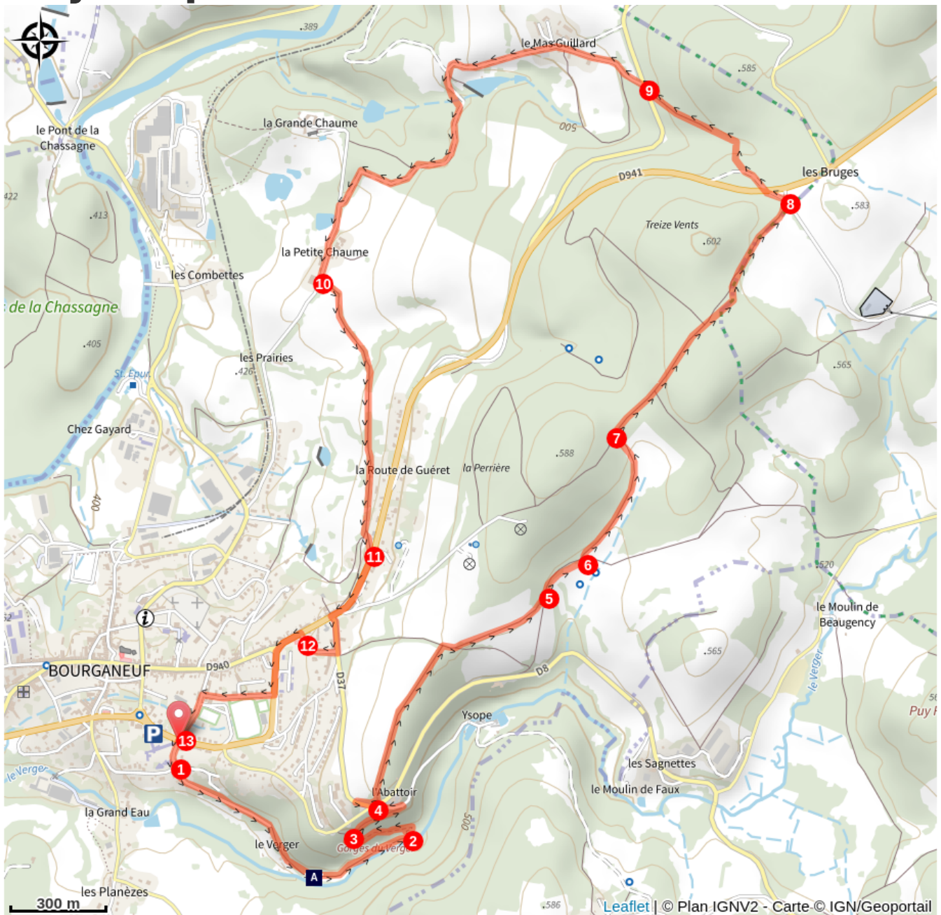
~ The gorges of the Verger (A)