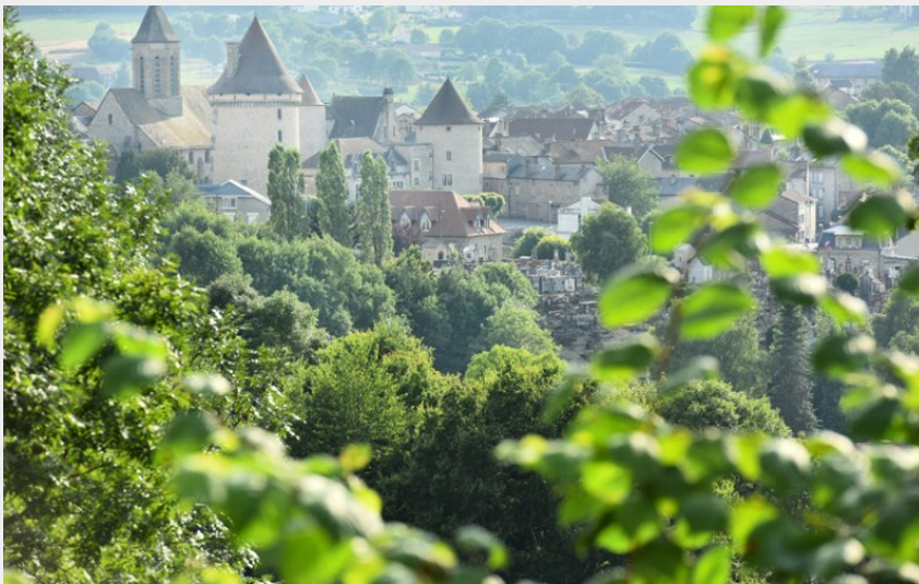
Point de vue sur Bourganeuf