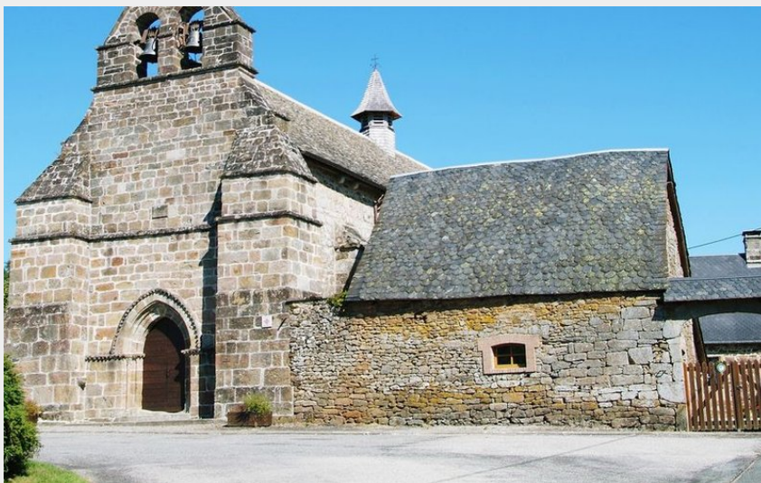
Eglise de Saint-Hilaire-Foissac