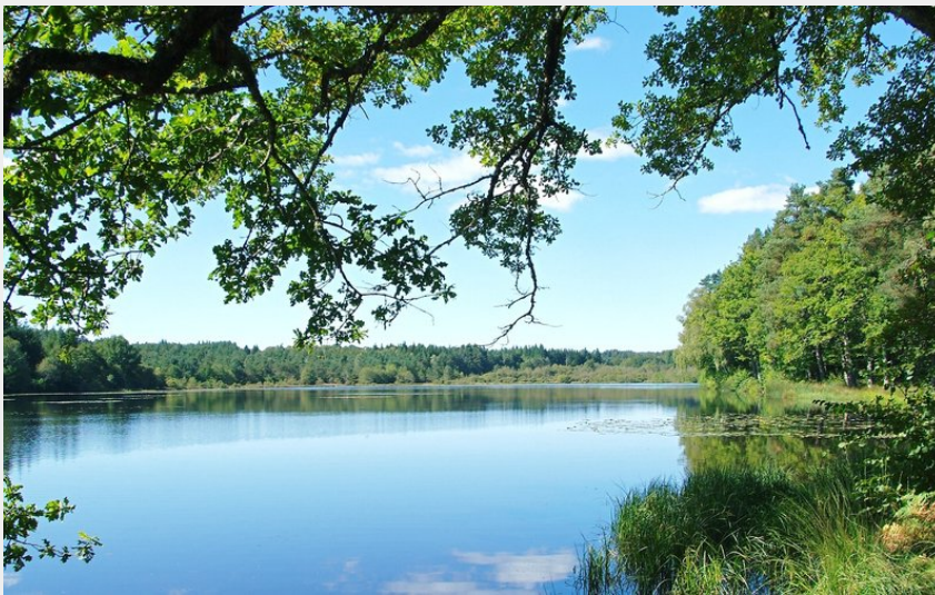
Etang de Gros