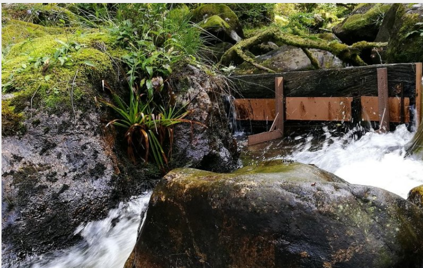
La Rigole du Diable (bsavarypro)