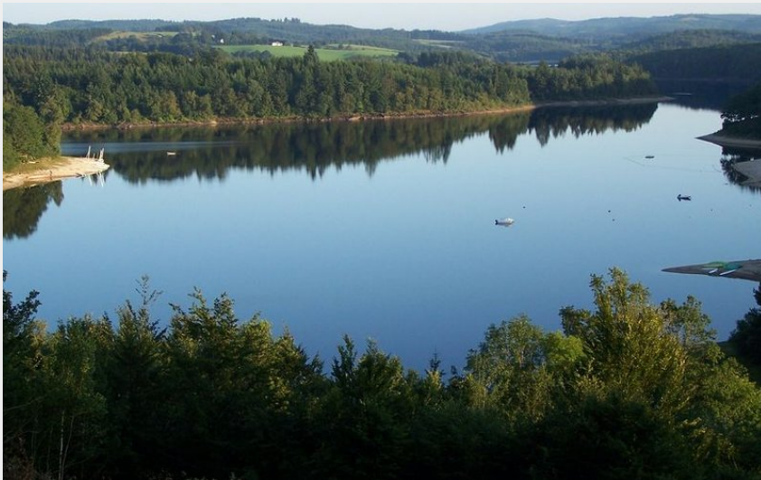
Lac de Viam (B.Bouche)