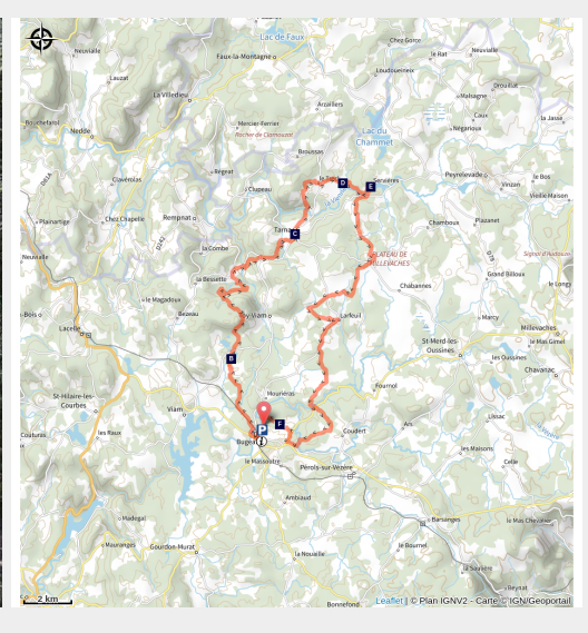
Rochers de Servières

Head for the rocks of Servières for a sporting route, classified black, a circuit more physically demanding than technical.