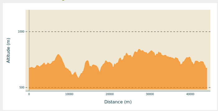
Min elevation 582 m Max elevation 843 m