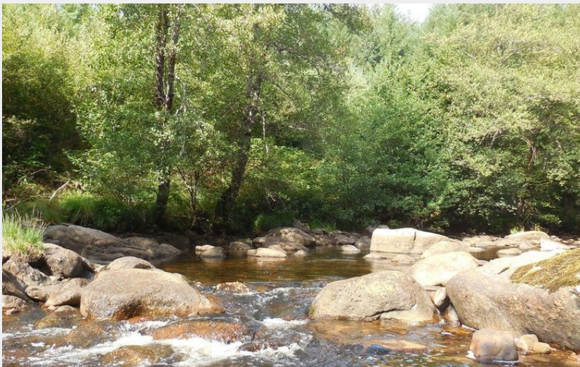
La Vézère