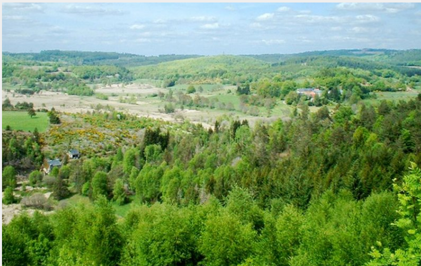
La vallée de la Chandouille (Le Lac de Vassivière)