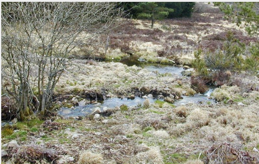
Tourbière (Le Lac de Vassivière)