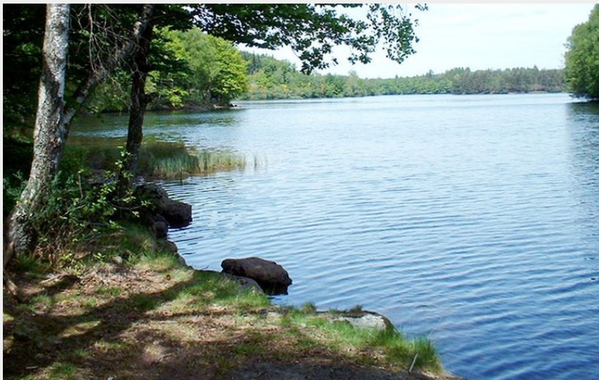
Lac de Faux (Le Lac de Vassivière)