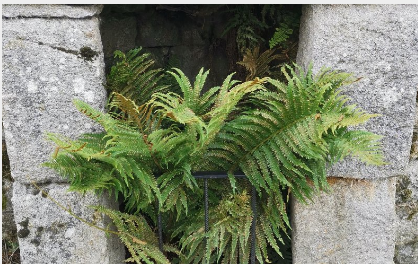
Ancien puits