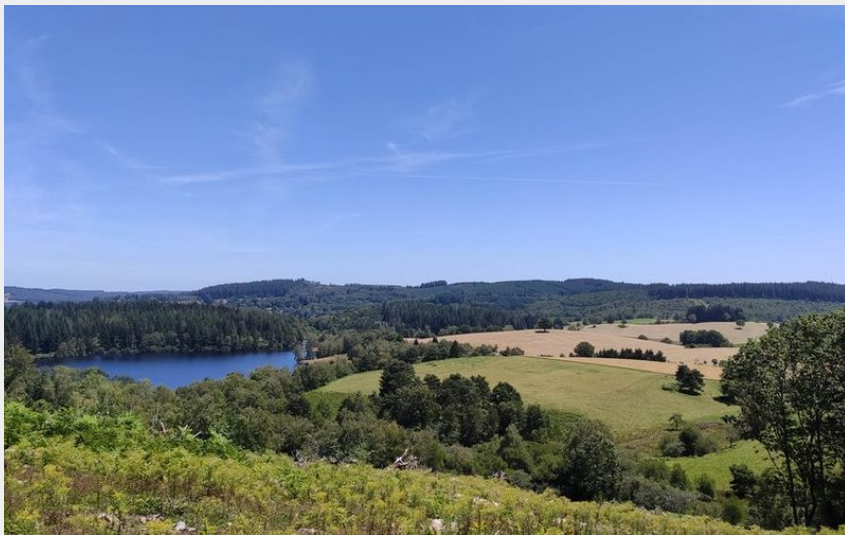
(A.Clavreul - PETR Monts et Barrages)