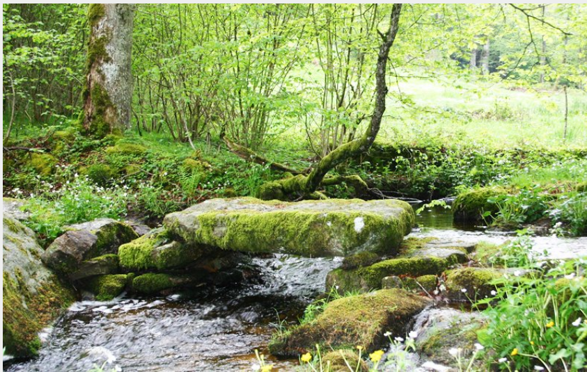
(Le Lac de Vassivière)