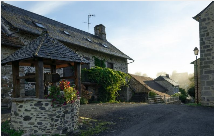
(B.Charles - OT Terres de Corrèze)