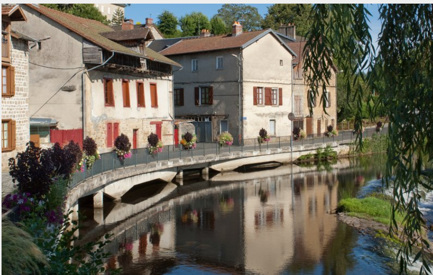
Bords de Vienne