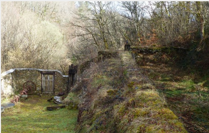
Vestige du moulin de Saint-Hilaire et sa retenue