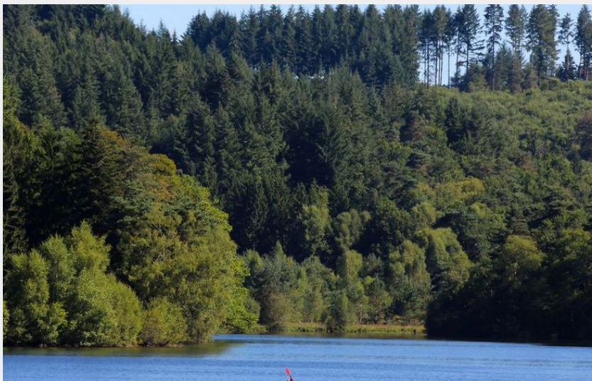
Étang de Meyrignac-l'Eglise (CC VEM)