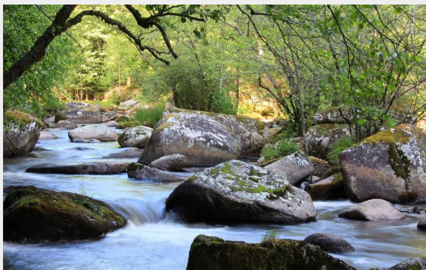
La Vallée de la Diège (D.Agnoux)