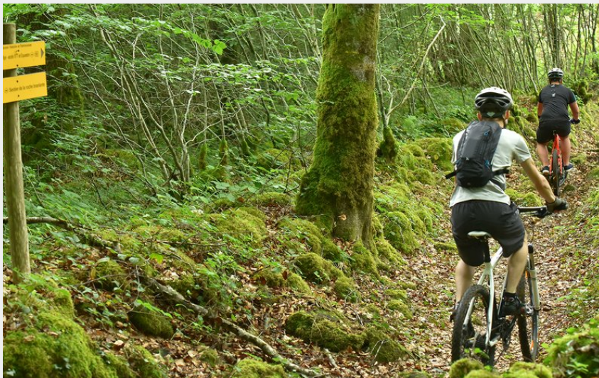
Forêt d'Epagne en VTT

Sud Creuse – Aubusson – lac de Vassivière – Saint-Amand-Jartoudeix