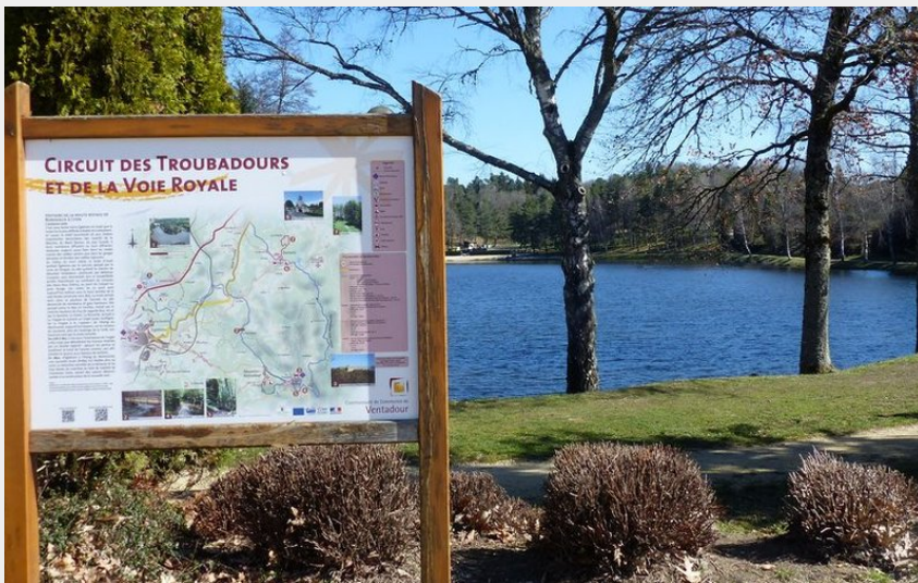
La voie royale