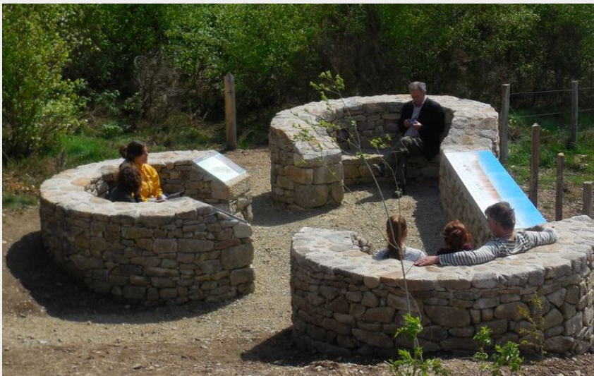
Sur le sentier des Sources de la Vienne