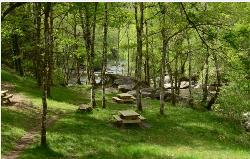
Aire de pique nique les Gorges du Thaurion