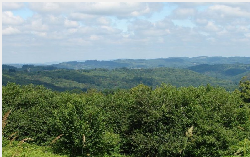
Vue sur les monts Limousin (CC Portes de Vassivière)