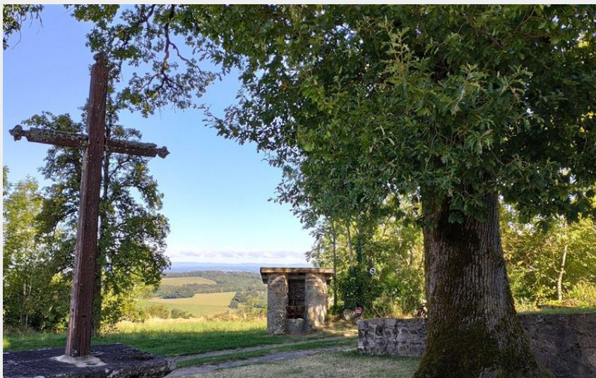
(A.Clavreul - PETR Monts et Barrages)