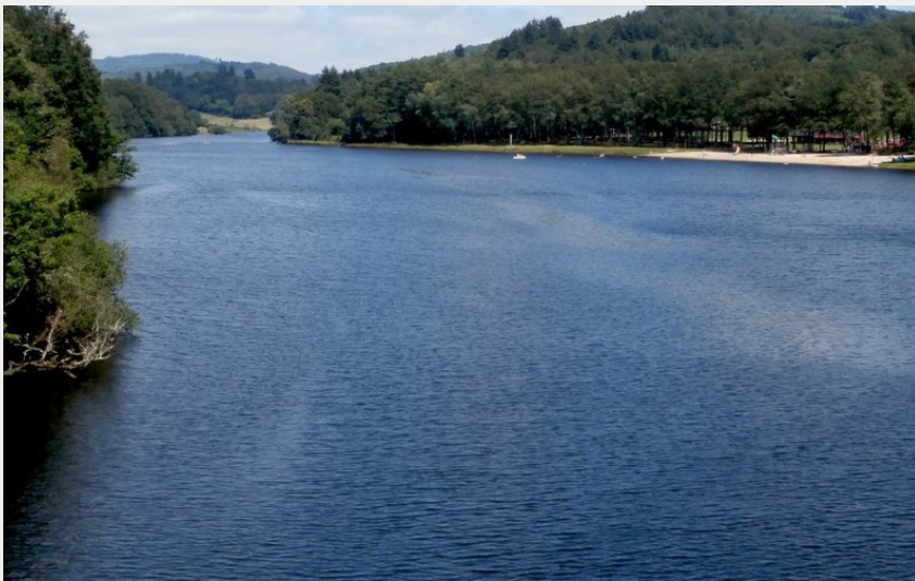
Vue sur le lac Ste Hélène