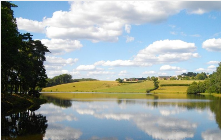
Lamazière-Basse (G.Salat - CC HCC)