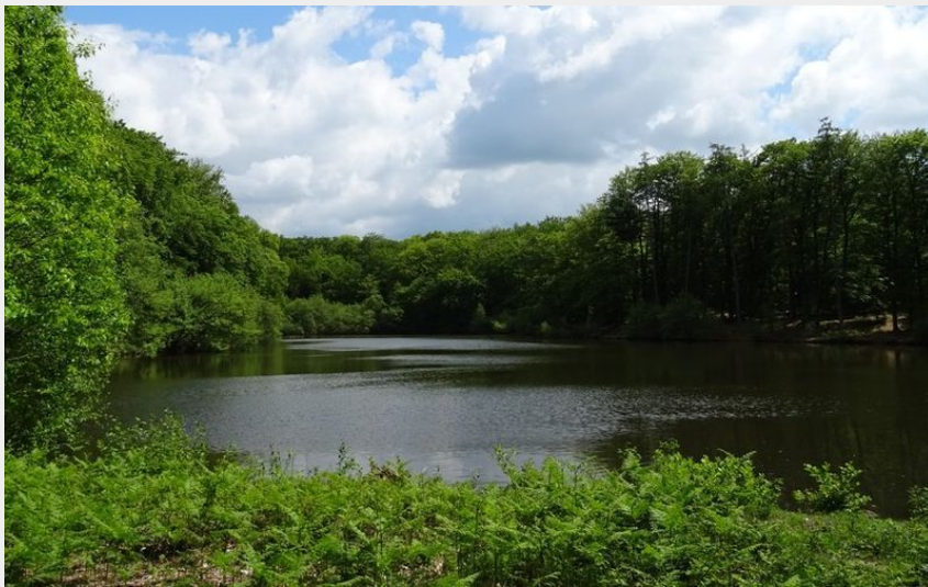
(M. Ildi - Office de tourisme de Noblat)