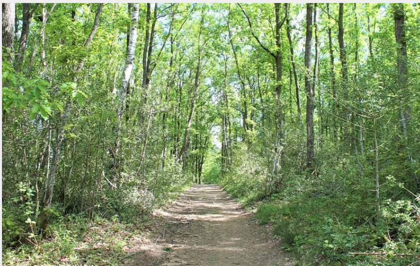
(O.Nugueo - CC HCC)