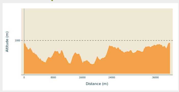
Min elevation 736 m Max elevation 973 m

Departure from the panoramic tower car park. Head towards the tower.