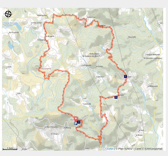
Château de Rochefort