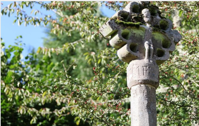
Les Croix de Millevaches