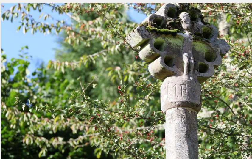
Les Croix de Millevaches