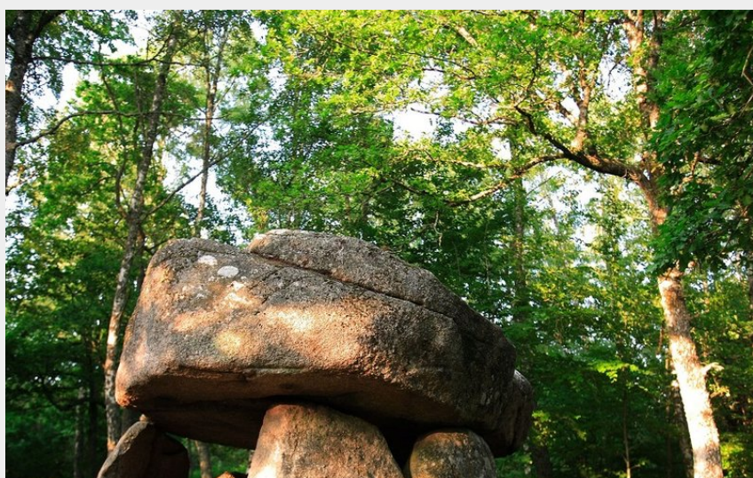
Dolmen d'Urbe