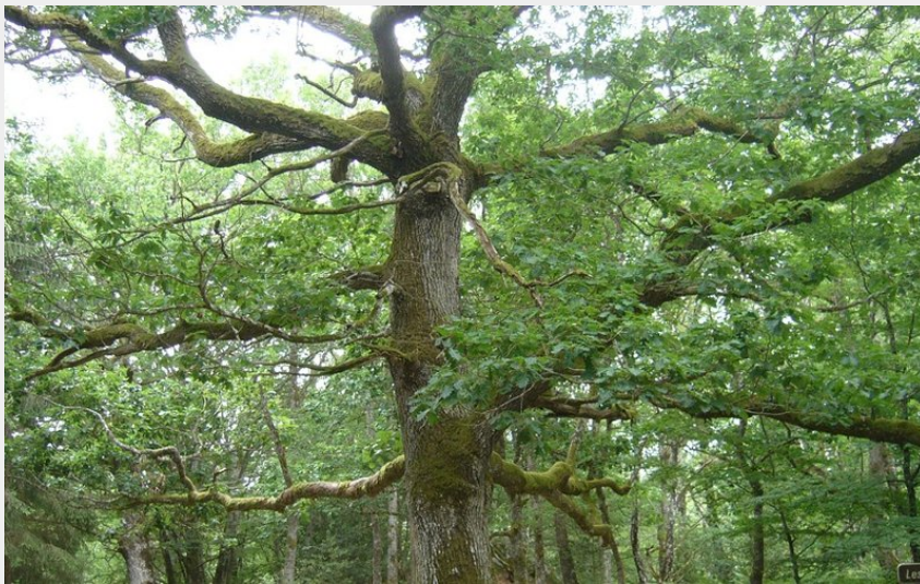
Dontreix - Forêt de Drouille (MCEA)