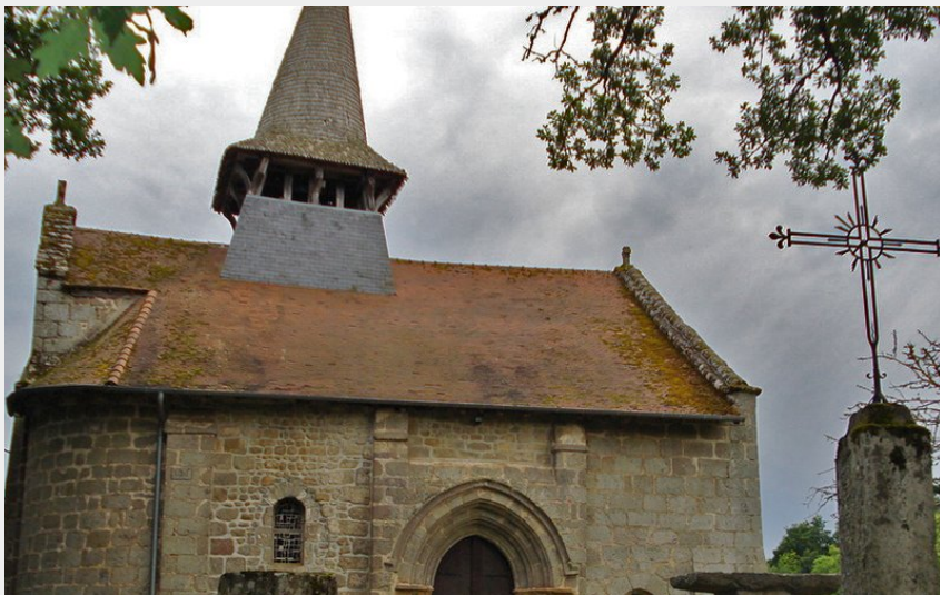
St Médard la Rochette - Eglise de La Rochette (Commune de St Médard la Rochette)