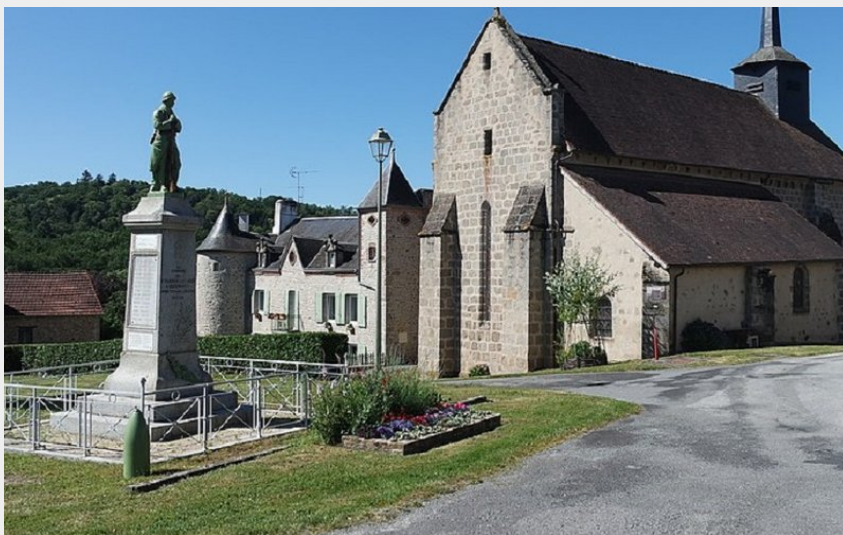
St Pardoux les Cards (MCEA)