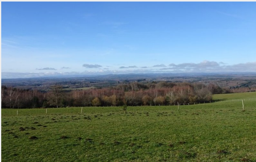
(J.Primpier - PNRML)