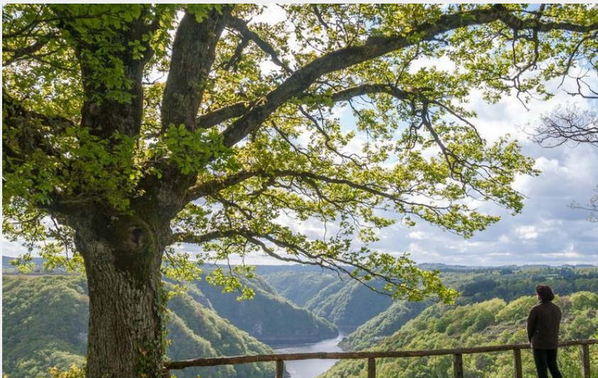
Saint-Nazaire

Gorges et plateaux de la Haute-Dordogne - Sarroux - Saint Julien