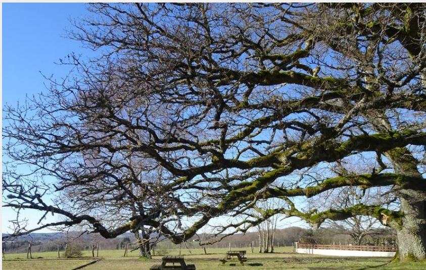
(J.Primpier - PNRML)