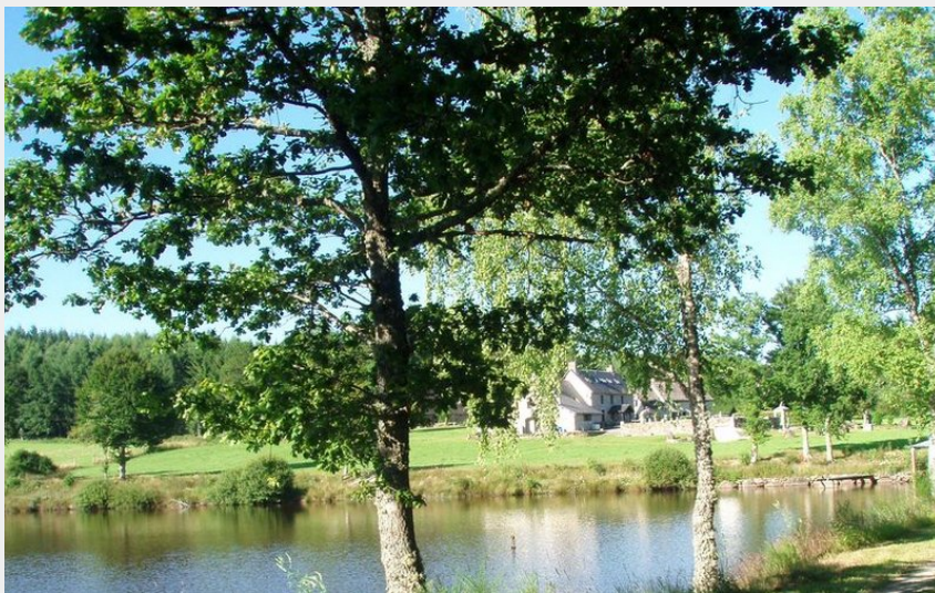
(G.Salat - CC HCC)