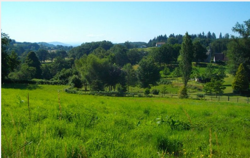
(V.Mendras - CC HCC)