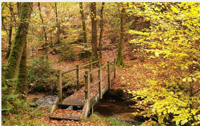
Le Bois des Boeufs (bsavarypro)